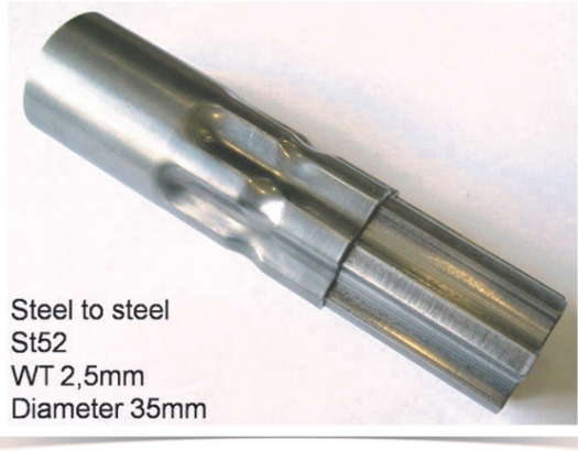
Steel to steel St52 WT 2,5mm Diameter 35mm